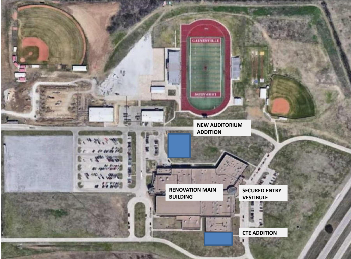
GAINESVILLE HIGH SCHOOL