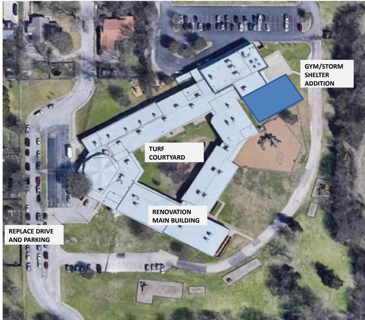
EDISON ELEMENTARY SCHOOL