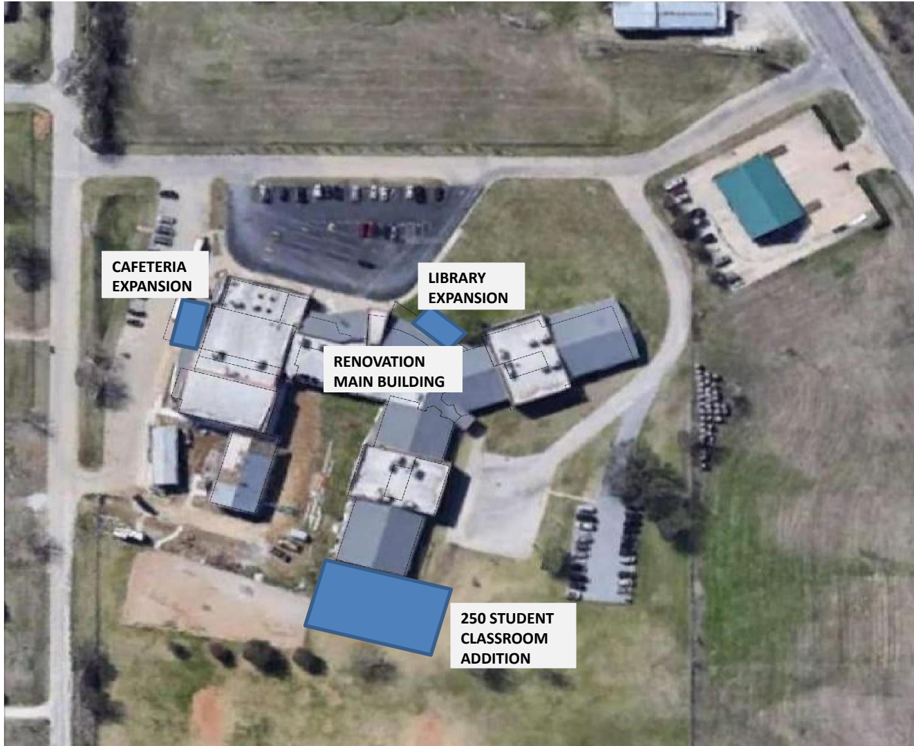
GAINESVILLE INTERMEDIATE SCHOOL