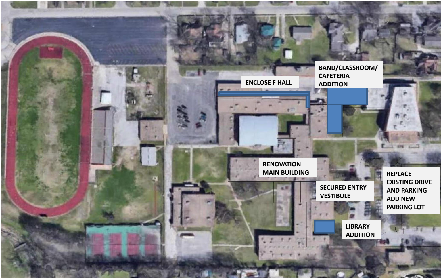
GAINESVILLE JUNIOR HIGH SCHOOL