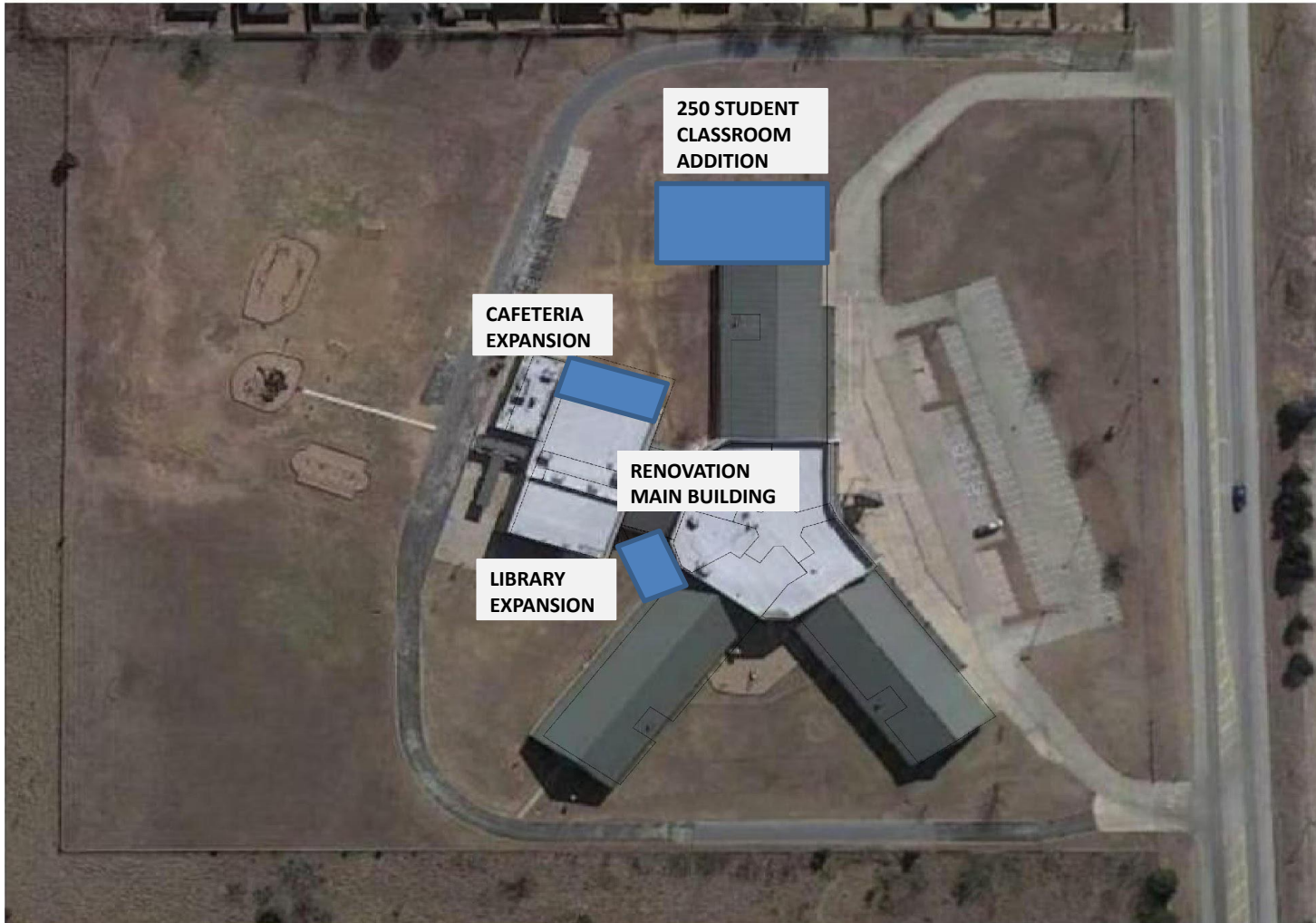
CHALMERS ELEMENTARY SCHOOL